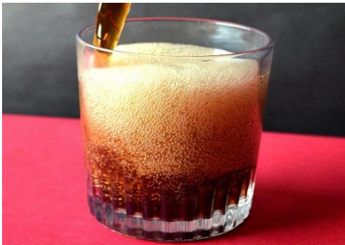
air as bubble