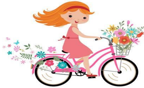
riding a bicycle