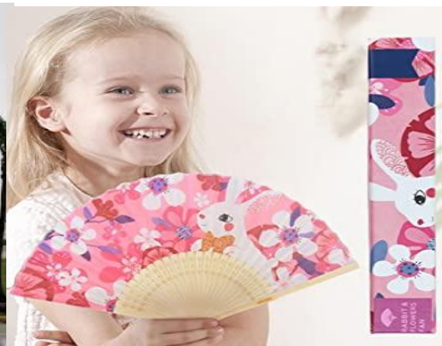
Air can move leaves of trees When we use fan